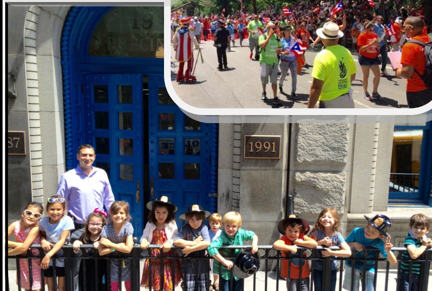
In June we welcomed ESES PS 267 Pre-K class to the precinct for a tour. Great having you, come back soon!