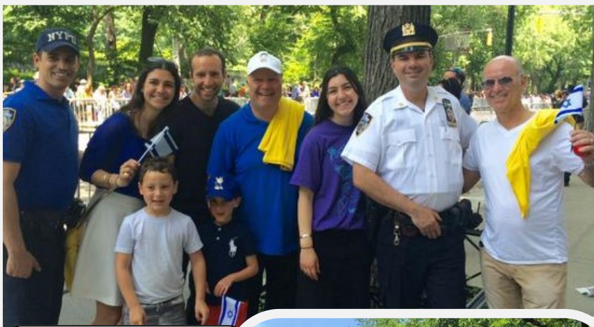
Both the Celebrate Israeli Day & Puerto Rican Day parades went off without a hitch! What great days for both amazing celebrations!