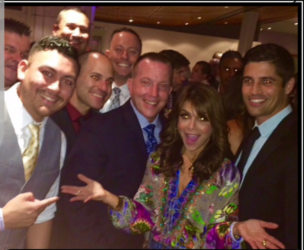
Paula Abdul took one step forward, two steps back & ran into members of 19th Precinct having an amazing evening benefiting the wonderful kids of the Ronald McDonald House NY!